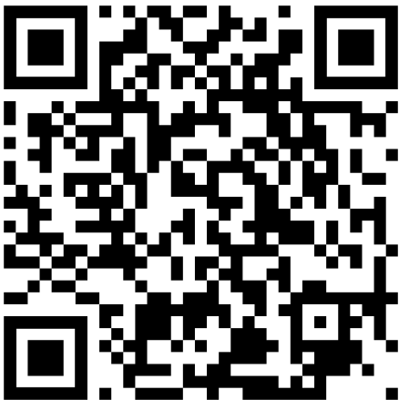
GT Freedom of Expression Policies