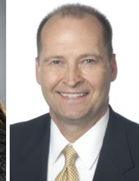
Greg King Institute Relations